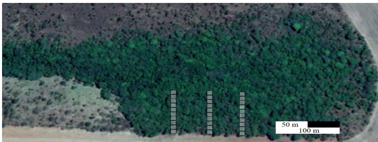
Figure 1: Demonstrative sketch of the transects within the Seasonal Semideciduous Forest (SSF).

The data for each variable (MBC, BR, qCO_2 , and \theta_g ) were submitted to the Lilliefors normality test, being considered normal ( p > 0.05 ). Analysis of variance (test F) was performed to determine the effect of the period of the year, distance to the edge, and interaction between these factors. When significant, the means comparison test was performed using the Tukey test at 5% probability, with the aid of the SISVAR statistical software, version 5.6 (Ferreira, 2019).